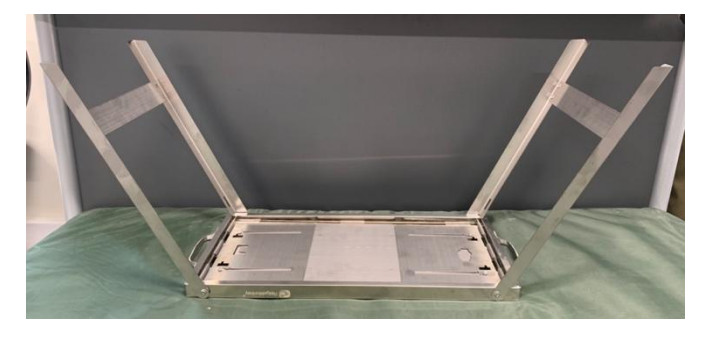
1: Remove Grilla BBQ from carry bag and fold out legs