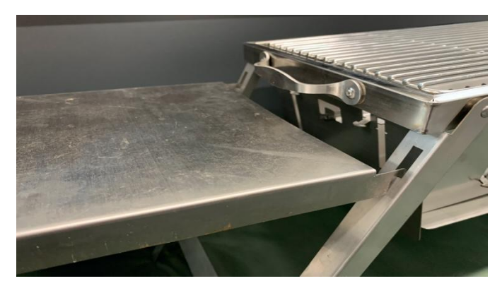
6: Attach side table into allocated slots, fold out legs

NOTE: If using coal or other solid fuel, ignite as required and skip to step 9