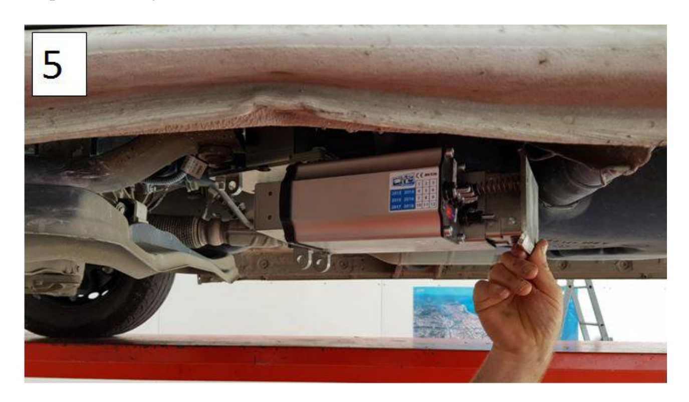
Step 3: Fix the jack.