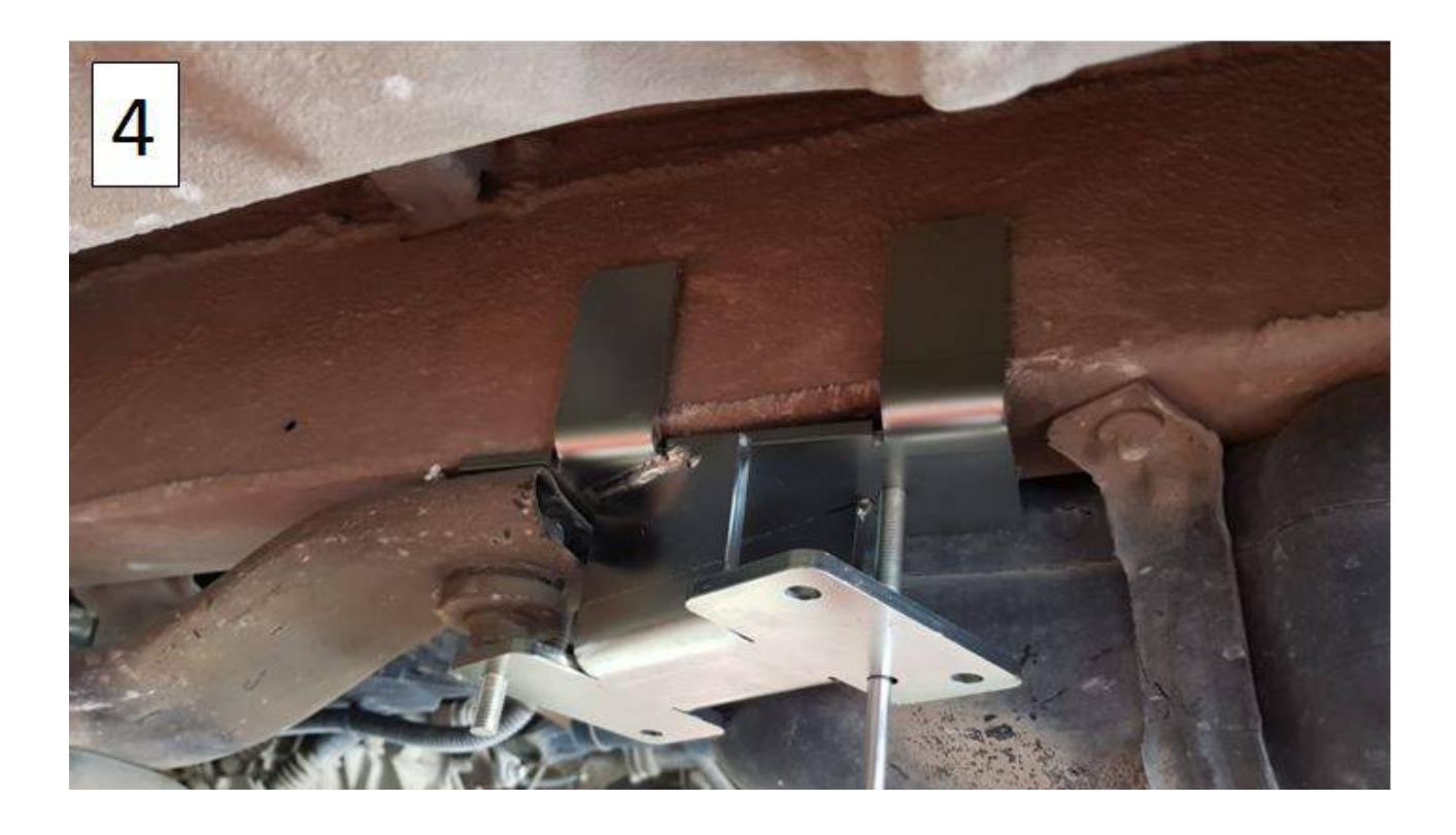
USE THE SAME PROCEDURE FOR THE FRONT RIGHT ADAPTER