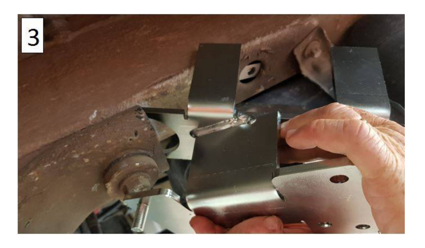
Step 2: Then fix the adapter with the bolt M10 supplied.