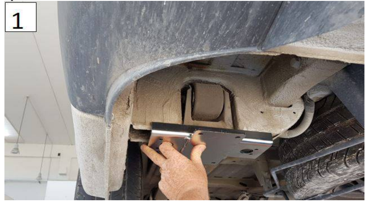
Put the adapter in the point illustrated, the rear support of the crossbow suspension