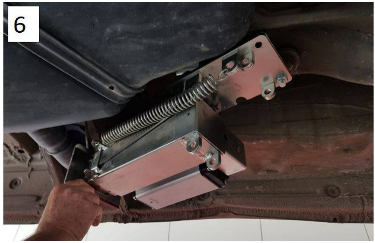
JACKS WITH MOTOR TO THE OUTSIDE OF THE VEHICLE AND ROTATION REAR