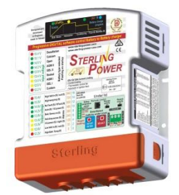
A battery-to-battery charger will charge a leisure battery whenever the engine is running.

The simple fact is that, if you buy a battery made by a reputable manufacturer (not a label printer), the chances of a battery failing as a result of faulty design or manufacture is almost zero.