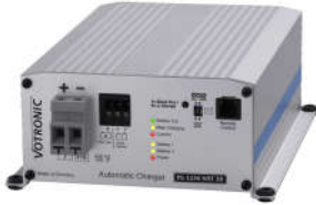
Votronic 15 – 80 Amp battery-to-battery chargers

A leisure battery is usually charged from three sources: the alternator (via the starter battery), solar panel/s and mains power. But, because the charging requirements of a lithium battery are different from those of a lead-acid battery, to get maximum benefit, you'll need specialised equipment such as what you see below.