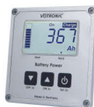
Votronic battery computer