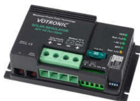
Votronic solar regulator 140W – 530W

For charging from mains hook-up/shore-power, the charger that comes with many vehicles may be sufficient if there's a gel or AGM setting. Again though, for maximum performance and long life, a dedicated lithium charger is advisable. The same applies to solar regulators: one with a lithium setting is well worth it in the long run.