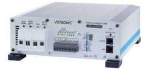
Votronic Triple 3-way battery chargers

Taking energy from the alternator is the most important way of charging for most people with a lithium battery. This can be done in different ways depending on what type of alternator your vehicle has. Many installations require a battery-to-battery charger such as those from CTEK, NDS & Votronic. This will charge the battery in the same way as a mains charger but by taking its power from the alternator.