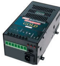
NDS Power Service Gold 3-way battery chargers