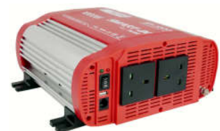
NDS inverters 400W – 3,000W

Many people like to keep an eye on their battery and a monitor such as Votronic's battery computer will show you exactly what's happening: state of charge, voltage and current in and out. Lithium batteries work well with inverters, enabling you run almost any mains appliance at any time, including microwave ovens and hairdryers.