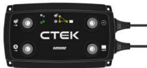
CTEK 20 Amp battery-to-battery charger

NDS & Votronic also have 3-way models which charge from the alternator, mains hook-up and solar panels. Whichever model you choose, you can be sure that your lithium battery will be charged correctly.